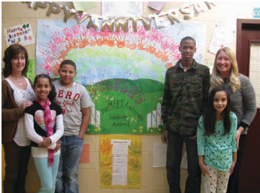
Students and staff celebrate Westbridge Academy's 40th Anniversary.

When Westbridge Academy – then, the Child Development Center – first opened its doors in 1973, it served just six children.