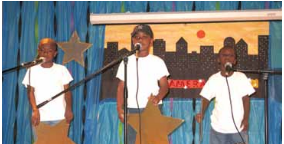
Westbridge Academy students participate in a range of activities, including our annual talent show.

Where can you go to be serenaded by musical numbers, share some laughs with your friends, and gasp in awe of magic acts? The annual talent show at Westbridge Academy! The student performances this spring boasted an impressive range of talent and was the product of the hard work, focused dedication, and creative effort of nearly the entire student body.