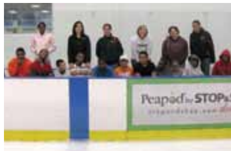
An ice skating rink trip focused on simulating the cold, dark depths of outer space.