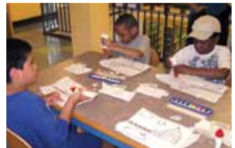
At the library, students engage in art projects focusing on places.