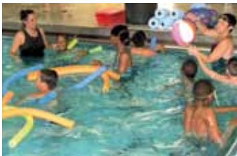
Students cool off at the YMCA while learning about bodies of water.

In the classroom a smaller student body makes for a great student to teacher ratio and allows instructors to maximize the amount of attention given to individual members of the class. Teachers were happy to report that the students in the ESY program displayed excellent behavior and that there were fewer disruptive incidents than during the school year. Overall, the first year of the ESY program successfully met all of the objectives set by the Westbridge Academy staff. ■